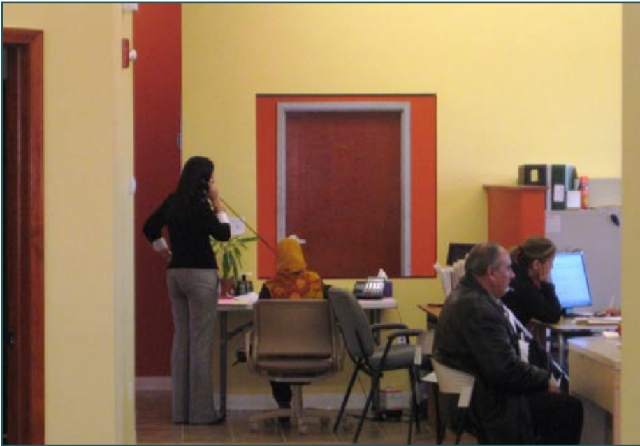
AAFS'S STAFF OFFICIALLY MOVED INTO THEIR NEW OFFICE SPACE IN BRIDGEVIEW, IL ON NOVEMBER 17, 2008