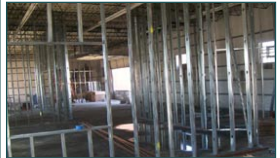
(ABOVE) CONSTRUCTION AT AAFS DURING RENOVATION (PHOTOS COURTESY OF AAFS)