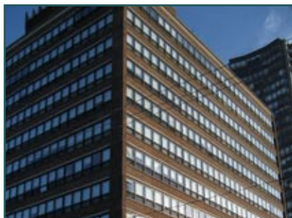
CCLF RECENTLY PROVIDED A LOAN TO HEARTLAND HOUSING, INC. TO HELP PRESERVE HOLLYWOOD HOUSE (ABOVE), A 197-UNIT AFFORDABLE SENIOR HOUSING BUILDING

CCLF is joining the efforts of the Preservation Compact as a Keystone Initiative partner. With support from Bank of America, The John D. and Catherine T. MacArthur Foundation, and the US Treasury CDFI Fund, CCLF will begin with a $2 million pool to aid preservation efforts. CCLF will serve a role as a Preservation Fund lender, providing purchase contract, acquisition, and supplemental predevelopment loans.