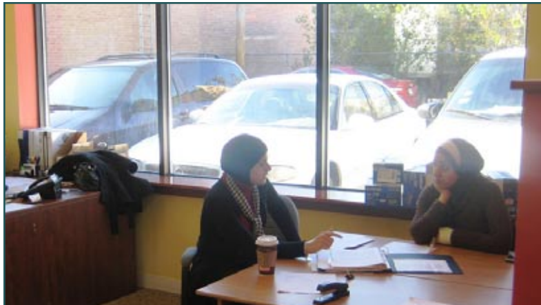
AN AAFS STAFF MEMBER MEETS WITH A CLIENT IN THE ORGANIZATION'S NEW OFFICES

“This new building, to us, is telling the community that we’re here to stay.”